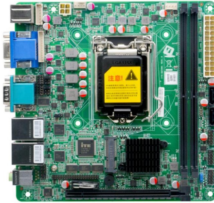
ITX-Q250M1 VER:1.0 正面图