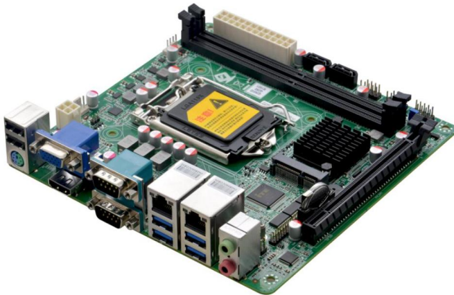
ITX-Q250M1 VER:1.0 侧面图