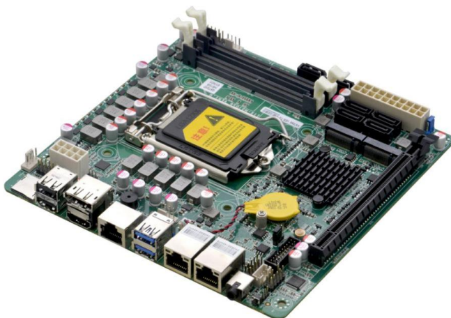
H570S6 VER:1.0 主板侧面图